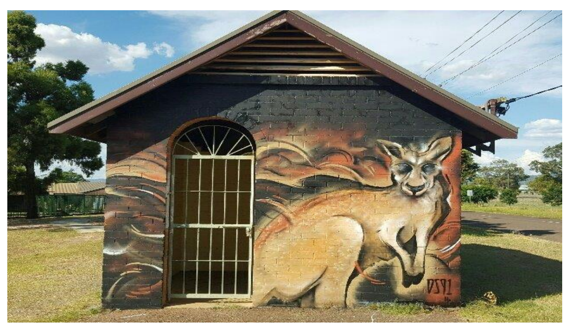
Commissioned art work at Granny Munro Park, Tamworth