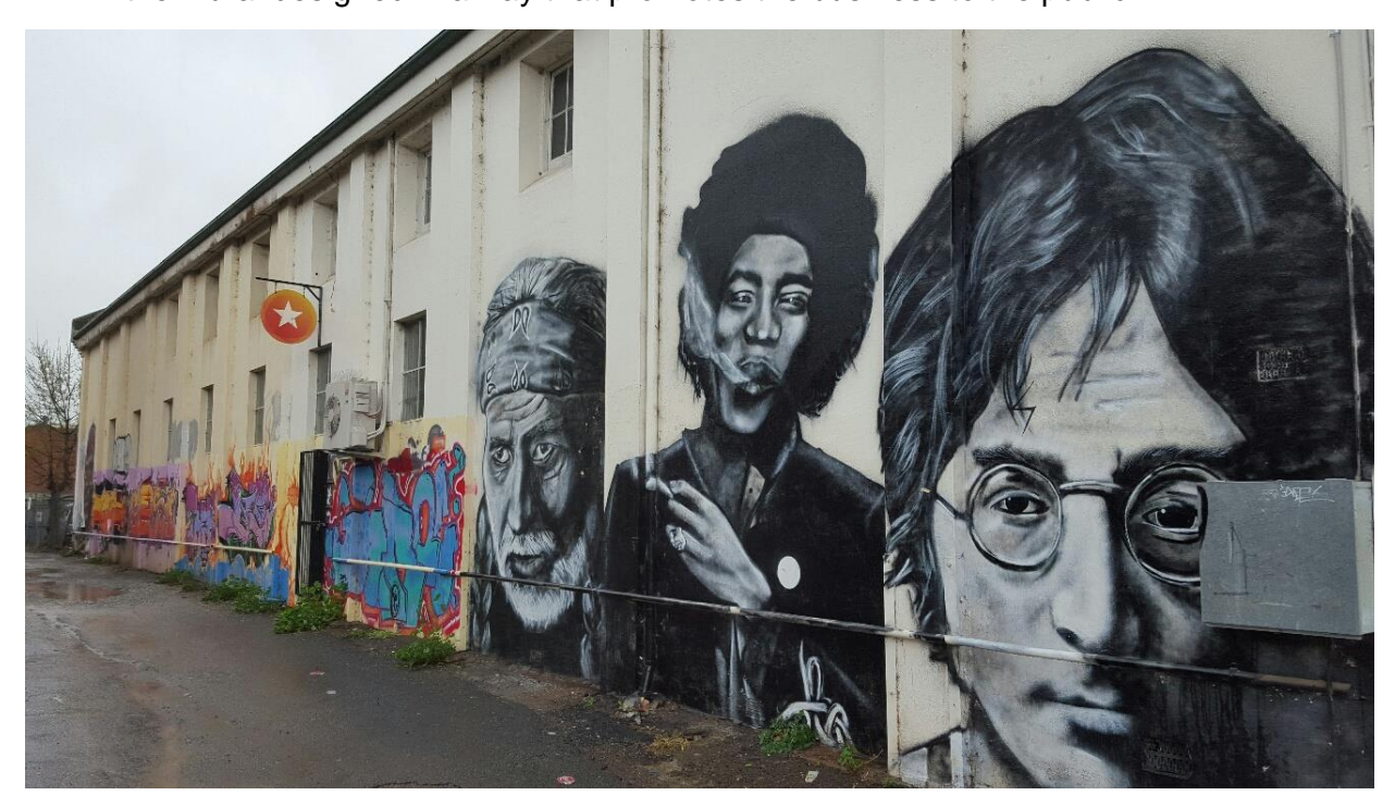
Commissioned art work on a privately owned building in Brisbane Street, Tamworth

Murals are a proactive strategy in minimising graffiti while also brightening up a dull area or wall. Business or commercial property owners can commission artists to have the mural designed in a way that promotes the business to the public.