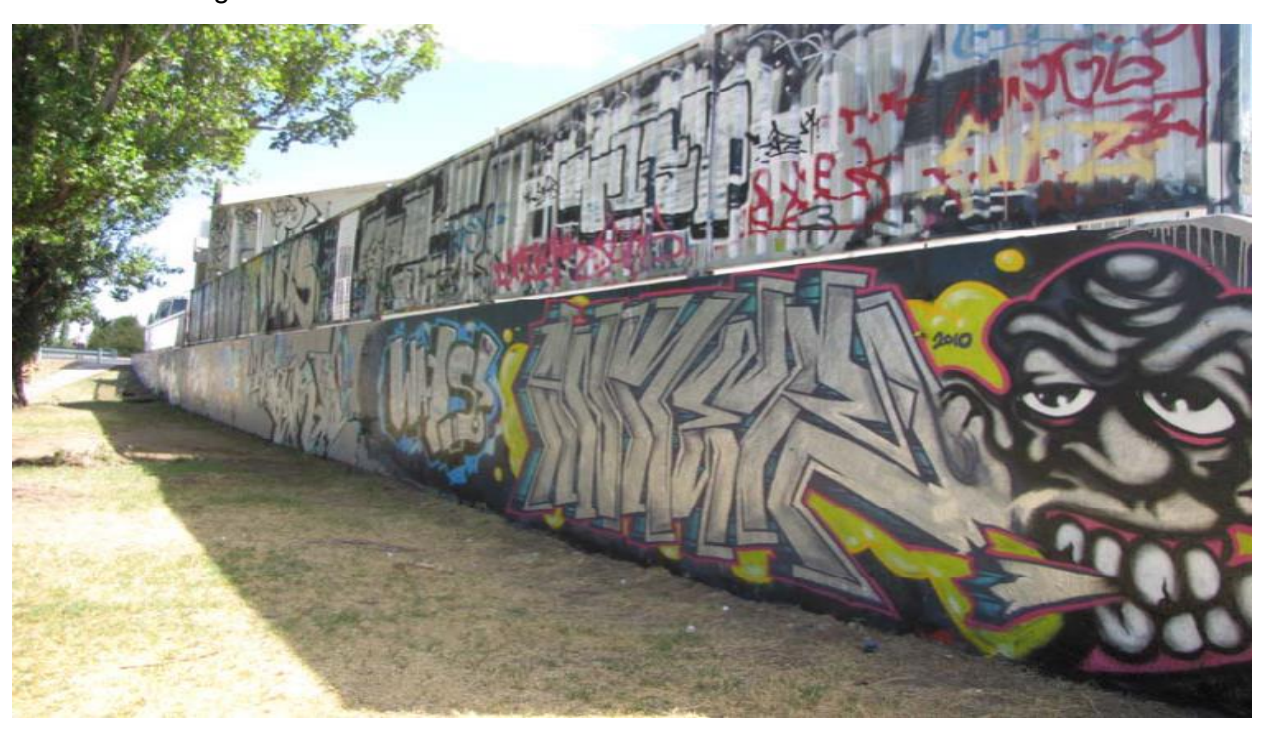
TRC's legal wall which is located adjacent to Solander Drive, Tamworth

Legal walls may deter graffiti incidents such as tagging by providing a legal outlet but only when the wall is maintained. Council aims to effectively manage existing and future legal walls.